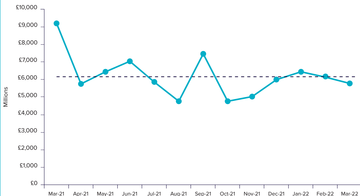
Total Value of Contracts Awarded

England recorded 78% of the value, with London accounting for 38% of the total. Ireland represented 6% of the total value, as a result of a £325 million contract for improvement works at Dublin Airport, outperforming Scotland (5%), Wales (3%) and Northern Ireland (1%).