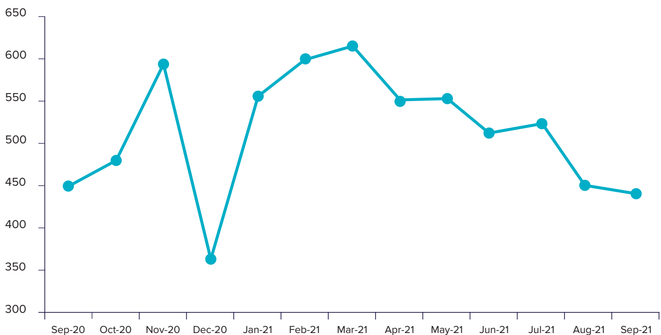
Total Number of Contracts Awarded

The number of contracts awarded in September was 441 , a 3% decrease compared to August (454) and 15% lower than the monthly average over the last year. However, it was consistent with the number awarded in September 2020 (450), indicating that construction activity does take time to pick up again after the summer break.